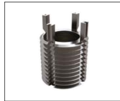
22030 - 22034 - Inch - Thinwall - Heavy Duty - Extra Heavy Duty Use installation tool no. 22054, 20058.