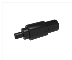
22054, 22058 for 22020, 22024, 22030, 22034,