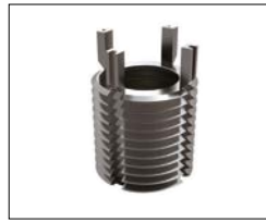
22006 - Heavy Duty - Metric Use installation tool no. 22062.