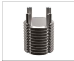
22040 - Metric - Carbon Use installation tool no. 22052.