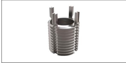
Stainless steel inserts