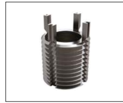
22030 - 22034 - Inch - Thinwall - Heavy Duty - Extra Heavy Duty Use installation tool no. 22054, 20058.