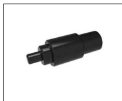
22062 for 22002 & 22006