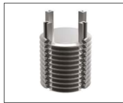
22042 - Metric - Stainless Steel Use installation tool no. 22052.