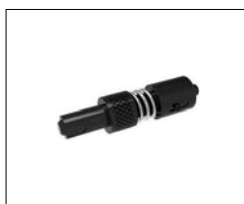
22052 for 22040 & 22042